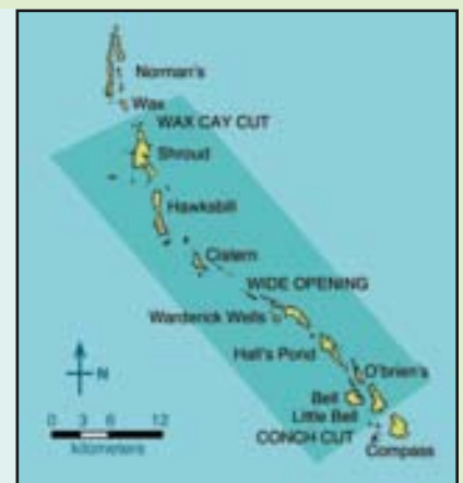
The 176-square mile Exuma Park was established in 1959 and designated as fully-protected in 1986.

“Spillover” occurs when populations of animals inside marine reserves increase over time, causing some animals to eventually move into less crowded neighboring areas where they can be caught by fishermen. “Seeding” occurs when larvae spawned in the reserve drift out and settle in fished areas. These young animals boost populations in surrounding waters. Through the processes of spillover and seeding, reserves can replenish nearby fishing areas.