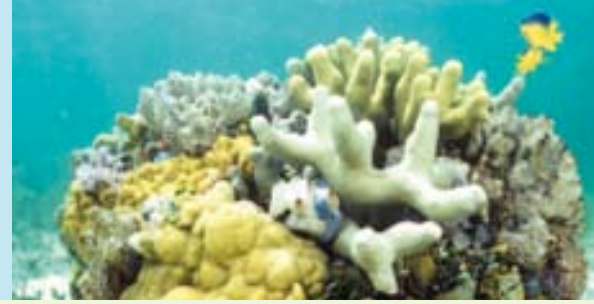
Kate Holmes, AMNH-CBG

A network of fully-protected marine reserves, such as the group of reserves being set up throughout The Bahamas, can be more beneficial in protecting marine life than any reserve can by itself. Together the reserves in a network should include the full range of marine habitats, be large enough and well-connected enough to protect marine populations, and also have the support of the human communities who use the marine resources.